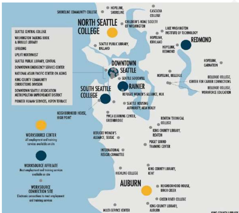
Figure 1. WorkSource centers, affiliates, and connection sites as of 1/29/24.

To accomplish these purposes, the One-Stop Operator is comprised of a team that includes an Integrated Service Delivery Director, a Training and Curriculum Coordinator, and an Outreach Coordinator. This team provides critical management and coordination for the entire regional One-Stop system.